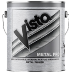
4800 Metal Pro Primer * Int./Ext.