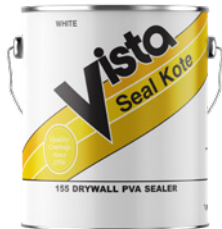
155 Seal Kote PVA Sealer Int.