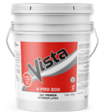
301 V-PRO 300 Primer ** Int.

Where Color, Creativity & Chemistry Meet!