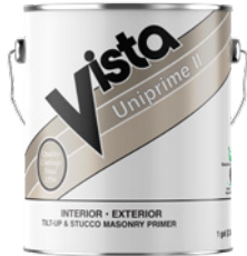
4600 Uniprime II * Int./Ext.