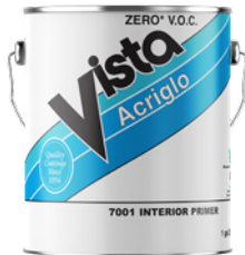
7001 Acriglo Primer ** Int.