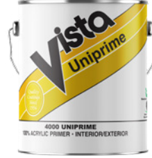
4000 Uniprime Multi-Purpose Primer * Int./Ext.