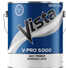
5001 V-PRO 5000 Primer ** Int.