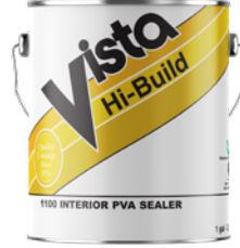
1100 Hi-Build PVA Sealer * Int.