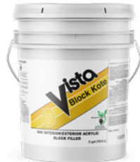
040 Block Kote Block Filler * Int./Ext.