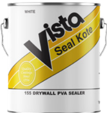
155 Seal Kote PVA Sealer Int.