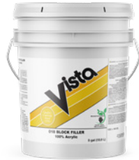
018 100% Acrylic Block Filler Int./Ext.