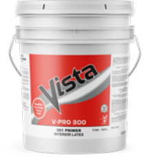
301 V-PRO 300 Primer ** Int.

Where Color, Creativity & Chemistry Meet!