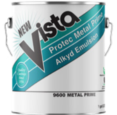
9600 Protec Metal Primer * Int./Ext.