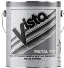
4800 Metal Pro Primer * Int./Ext.