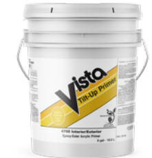
4700 Tilt-Up Primer Int./Ext.