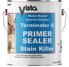
4200 Terminator II Int./Ext.