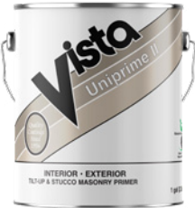
4600 Uniprime II * Int./Ext.