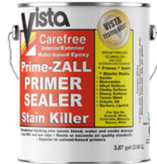
8000 Prime-ZALL Int./Ext.