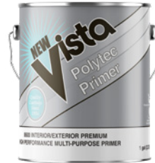
8600 Polytec Primer Int./Ext.