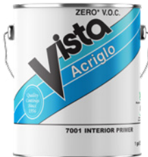
7001 Acriglo Primer ** Int.